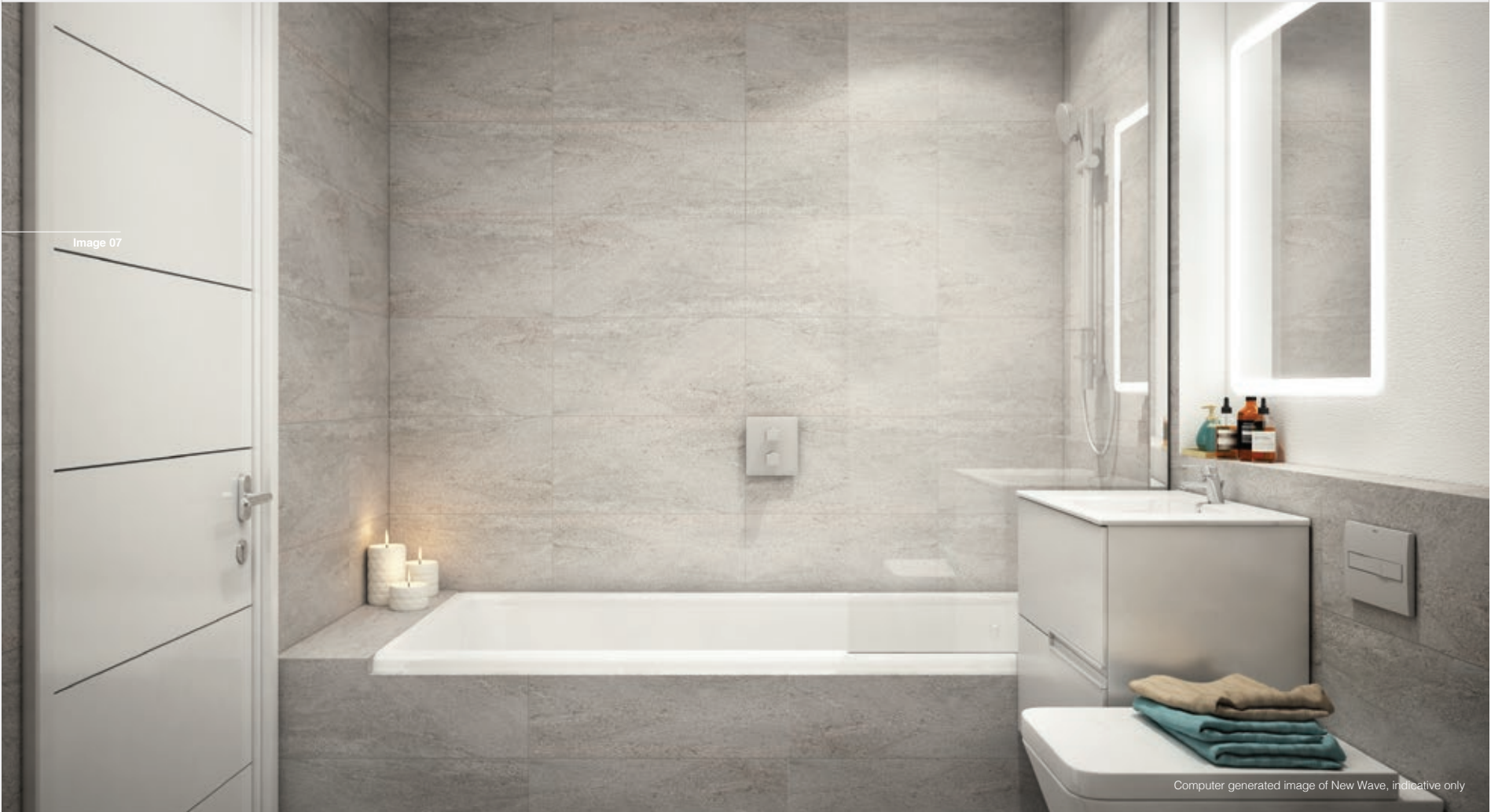
Computer generated image of New Wave, indicative only