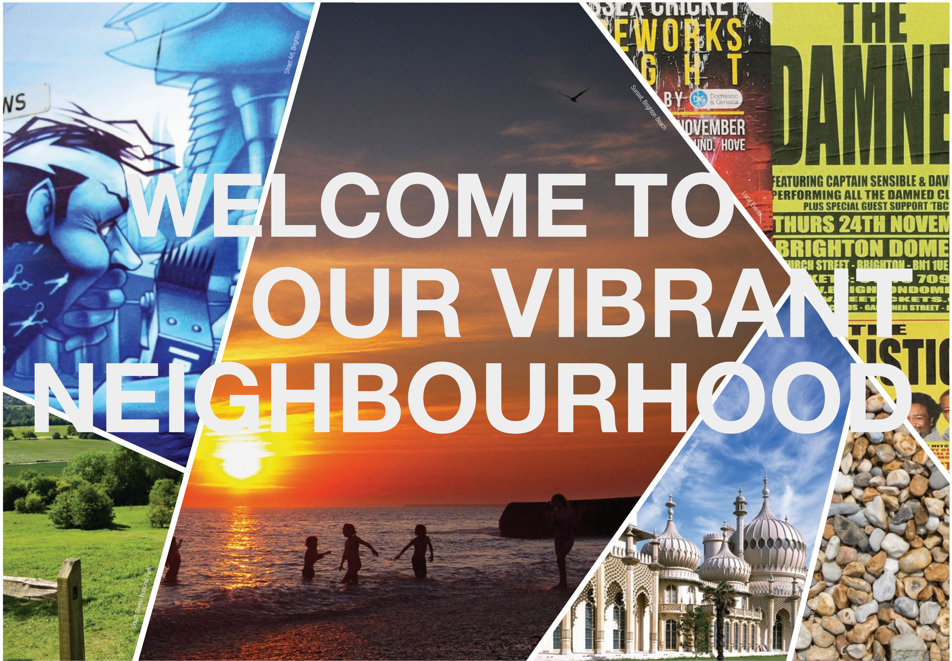
Street Art, Brighton