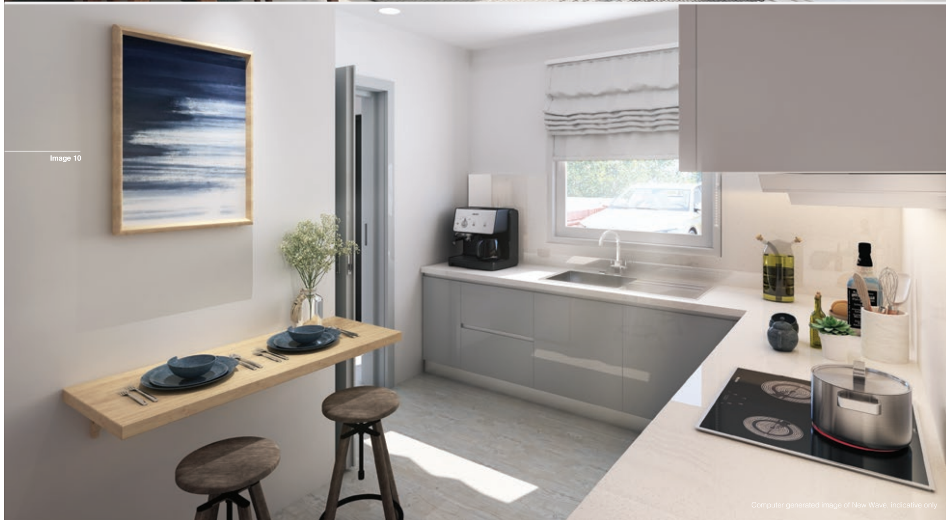
Computer generated image of New Wave, indicative only