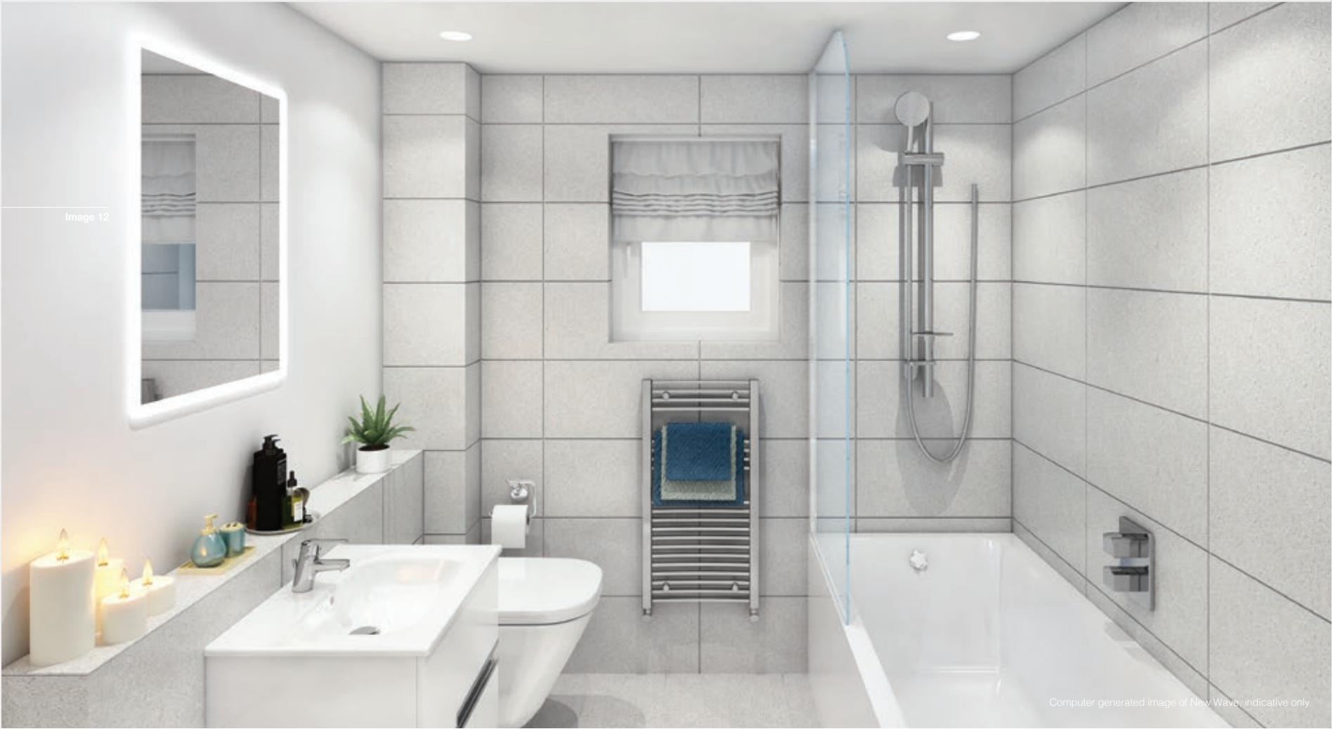
Computer generated image of New Wave, indicative only