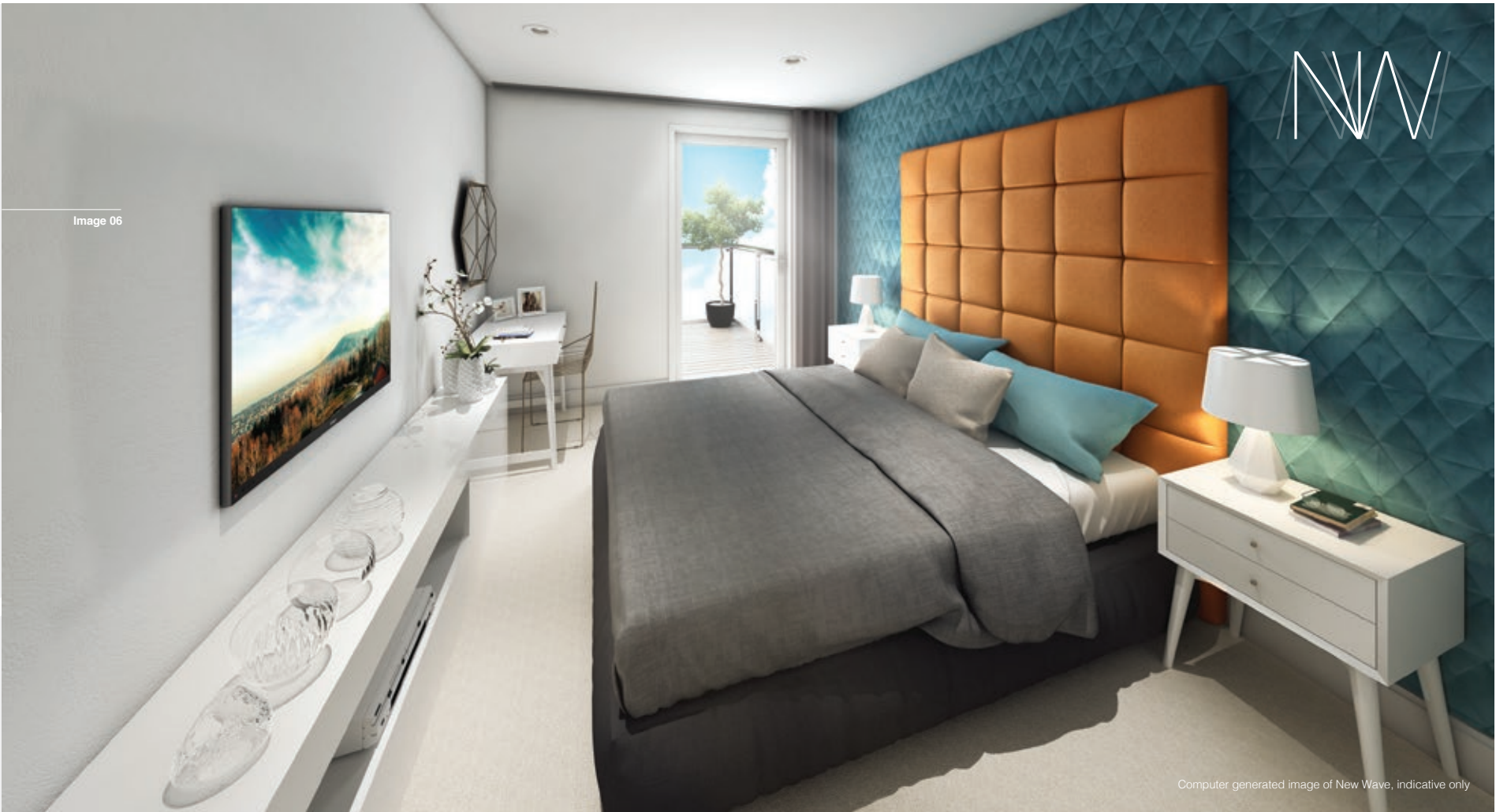
Computer generated image of New Wave, indicative only

The specifications provided are indicative and intended as a guide as to the finished product. Accordingly, due to Hyde New Homes' policy of continuous improvement, the finished product may vary from the information provided. This information does not constitute a contract or warranty.