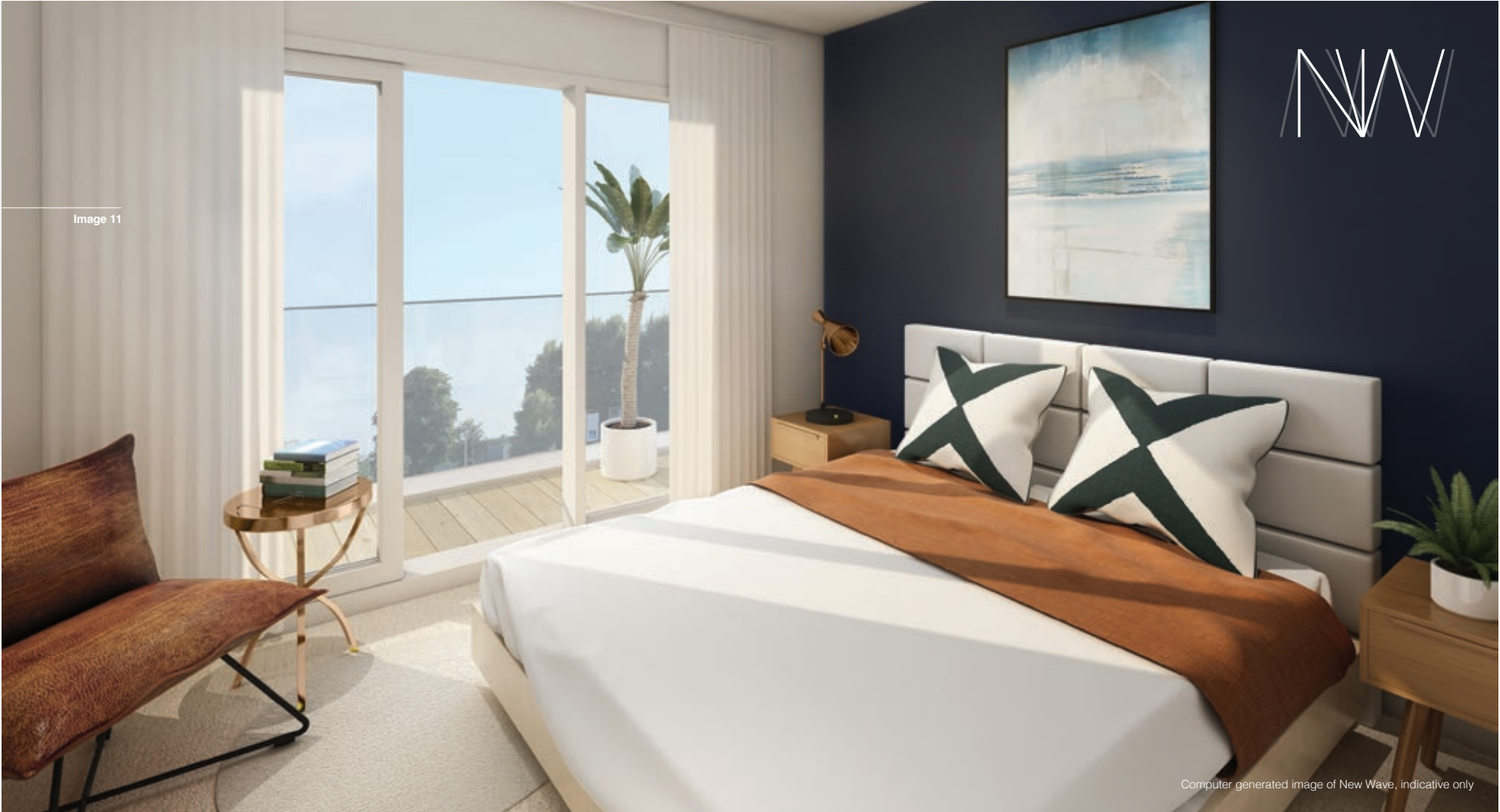
Computer generated image of New Wave, indicative only

The specifications provided are indicative and intended as a guide as to the finished product. Accordingly, due to Hyde New Homes' policy of continuous improvement, the finished product may vary from the information provided. This information does not constitute a contract or warranty.