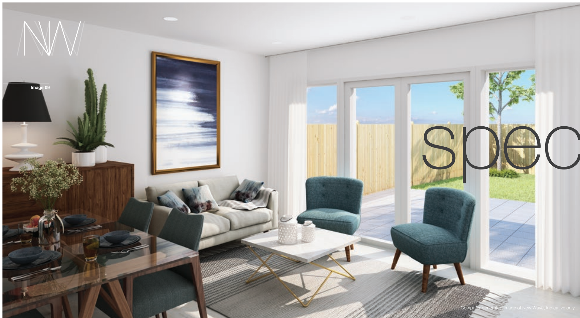
Computer generated image of New Wave, indicative only