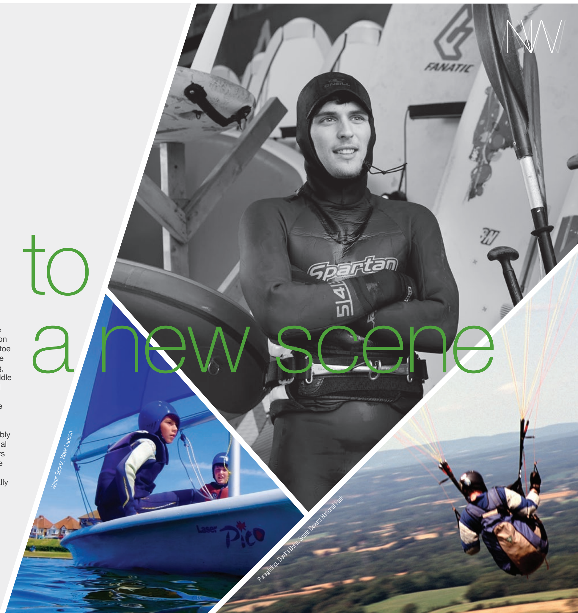
Water Sports, Hove Lagoon

The rolling hills of the superbly scenic South Downs National Park reward runners, cyclists and hikers alike, while at the popular paragliding spot of Devil's Dyke the sky is literally the limit.